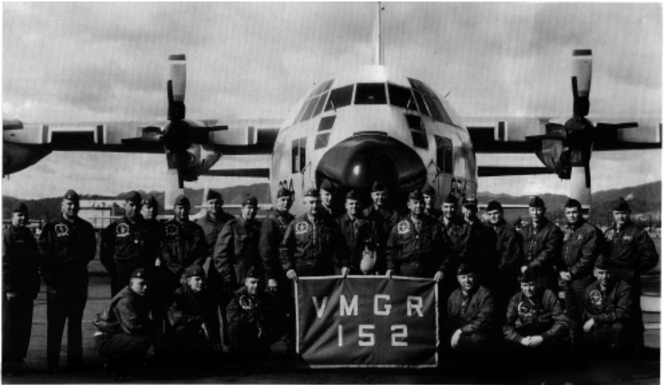
M.C.A.S. IWAKUNI, JAPAN 4 FEB 1964