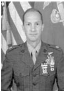
UNITED STATES MARINE CORPS