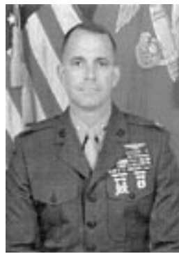
UNITED STATES MARINE CORPS