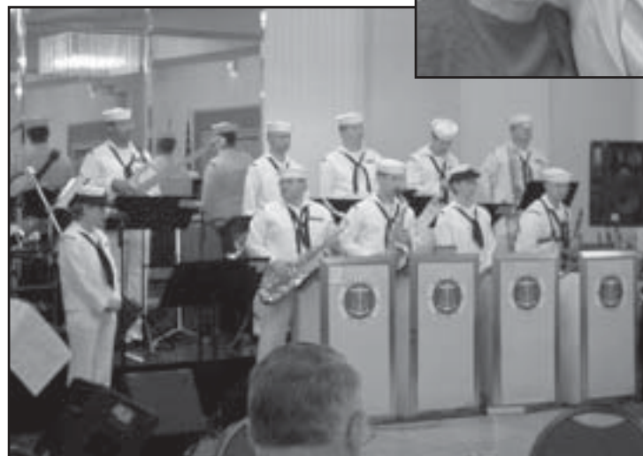
Mid-South Navy Band From Memphis