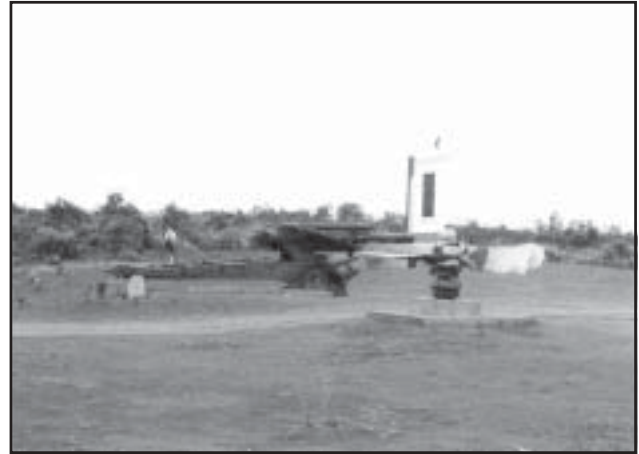
From The Editor,