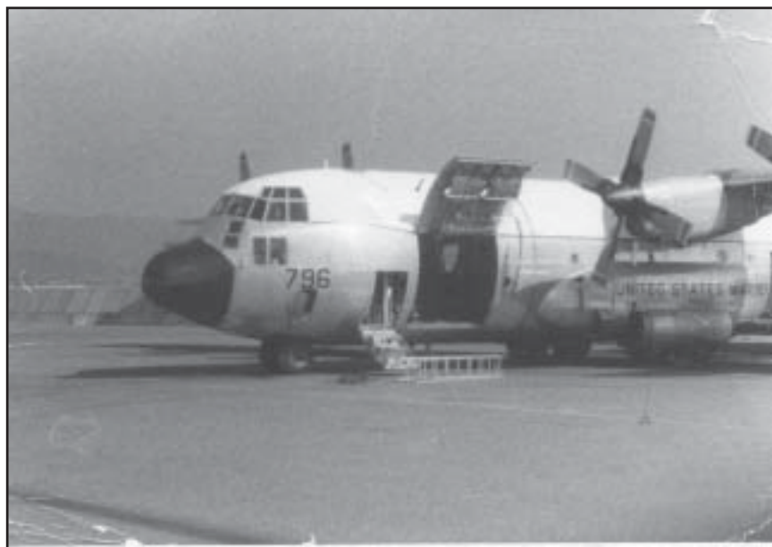
Does anyone remember the forward cargo door?